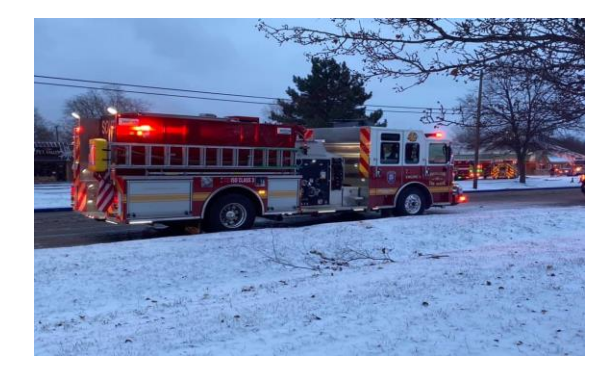
Engine 1 - 2016 Pierce Sabre