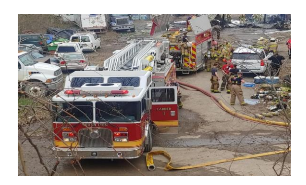
Ladder 1 – 2000 KME Aerial