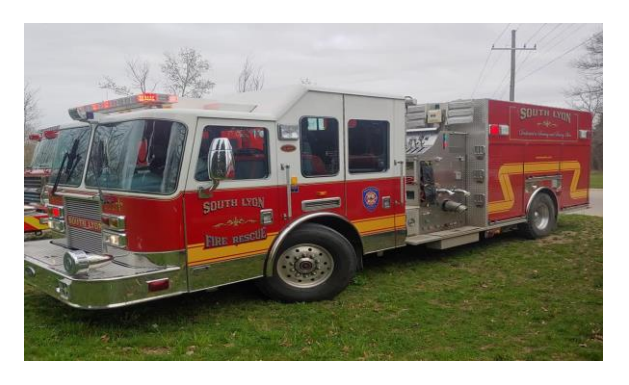
Engine 2 – 2008 KME Predator